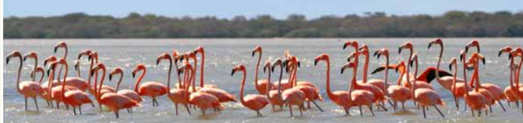
American Flamingo. E. Leupin