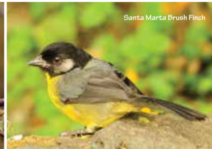
Santa Marta Brush Finch