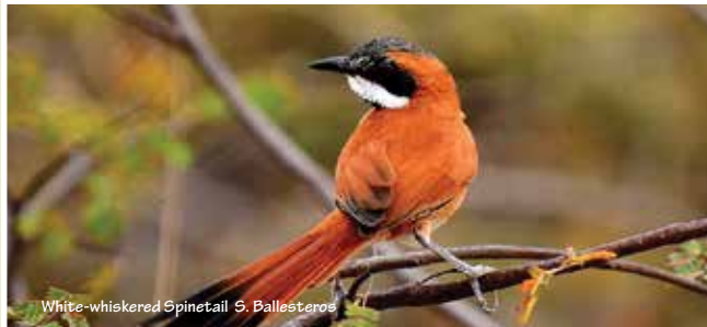
White-whiskered Spinetail S. Ballesteros

NEAR ENDEMIC: White-whiskered Spinetail, Red-billed Emerald, Coppery Emerald, Golden-winged Sparrow, White-tipped Quetzal, Black-fronted Wood-quail, Tocuyo Sparrow, Chestnut Piculet.